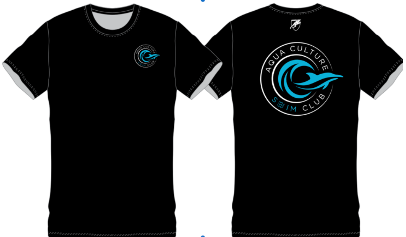
Aqua Culture Swim Club T-shirt

Reference: Swimmer Name and Item purchased.